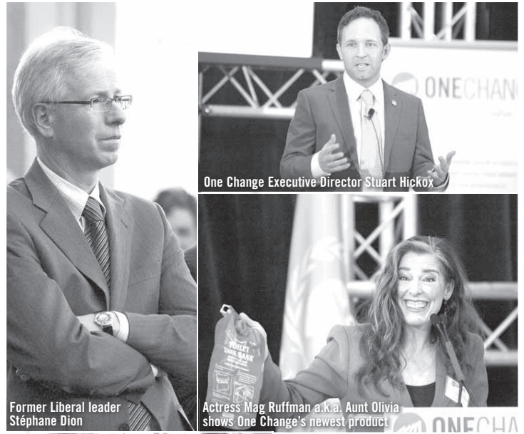
Former Liberal leader Stéphane Dion